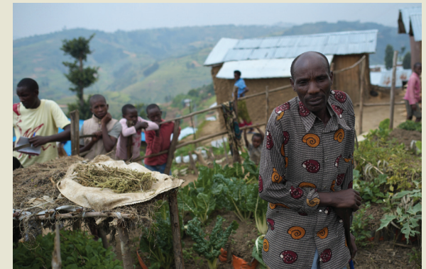
A beneficiary of the emergency nutrition interventions in the Kigeme Congolese refugee camp in Nyamagabe district.

Funded by Irish Aid, the programme is particularly relevant in a context like Rwanda where, with a population density of 440 people per square km (the highest in Africa and 29th globally), land scarcity and lack of available arable land is a huge issue. The extreme poor are closely identified as those with little or no land, are often overlooked by traditional agriculture-focused livelihoods programmes and usually have only labour to sell. The graduation programme is designed to target those extreme poor and seeks ways of identifying alternative, diversified livelihoods and a set of holistic, sustainable solutions to the barriers that hold them back from rising out of poverty.