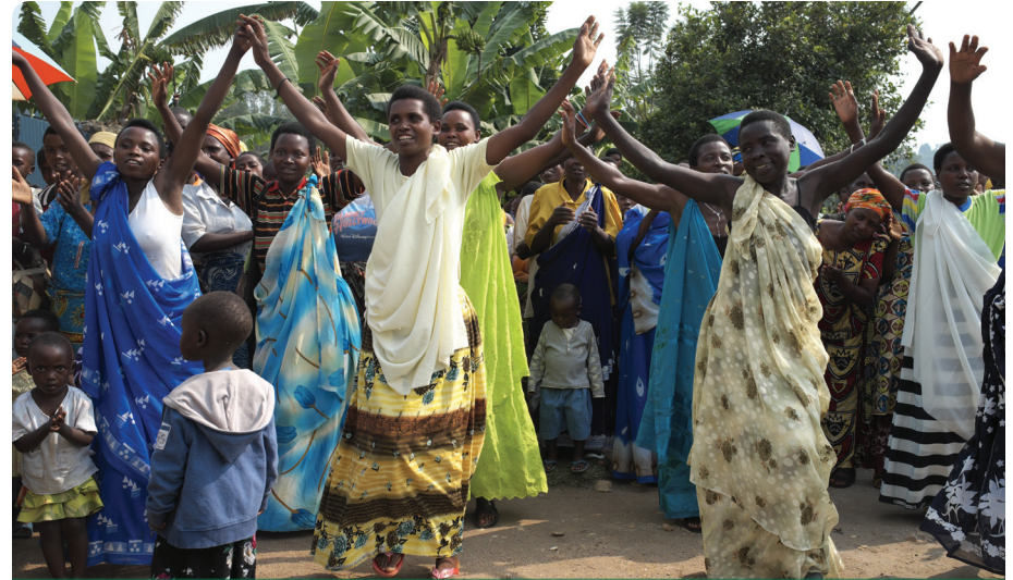
Women dance at a community health centre in the southern Rwandan village of Gisagara. The health centre is part of a community-based nutrition programme that Concern supports by training several hundred health workers.