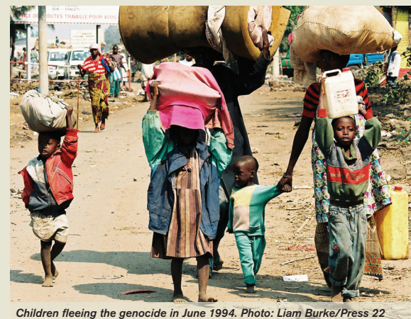
Children fleeing the genocide in June 1994.