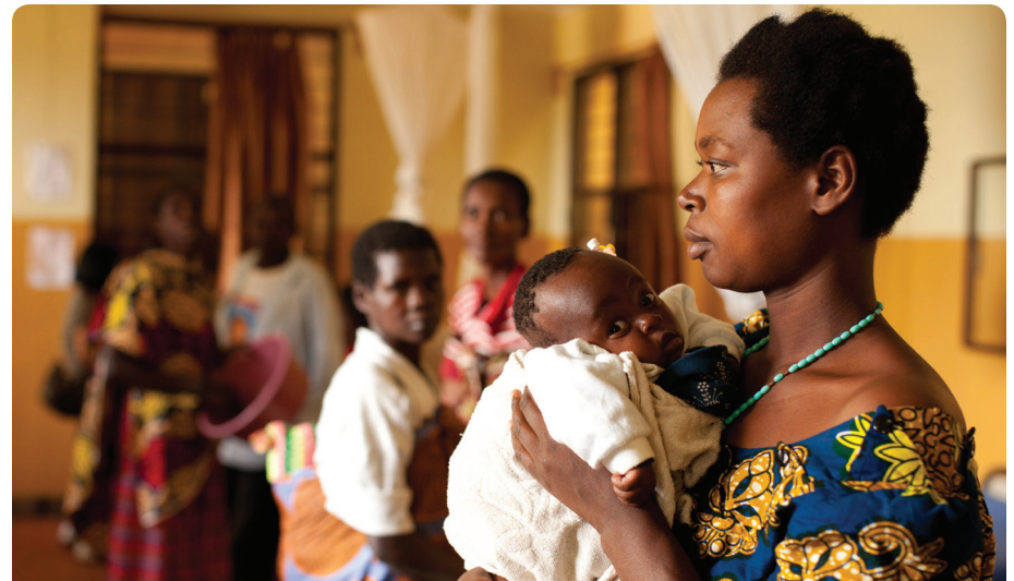
A mother waits for a local doctor to examine her child in Gasambu village, Rwanda. Concern's Kabeho Mwana (Life for a Child) programme worked to reduce child mortality in six underserved districts, reaching more than 318,000 children under five years old.