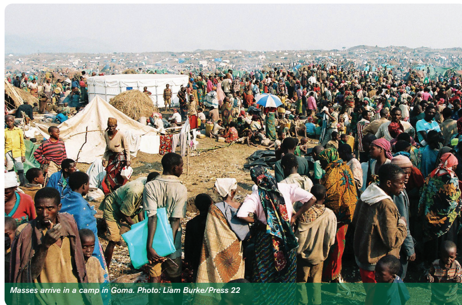
Masses arrive in a camp in Goma.