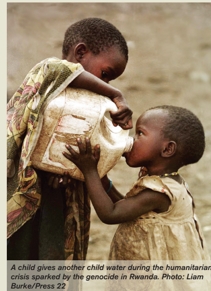
A child gives another child water during the humanitarian crisis sparked by the genocide in Rwanda.

1997 Out of an estimated 218,000 refugees repatriated back to Rwanda in 1997, a total of 11,568 returnees and 10,478 unaccompanied children passed through the Concern managed transit centres.