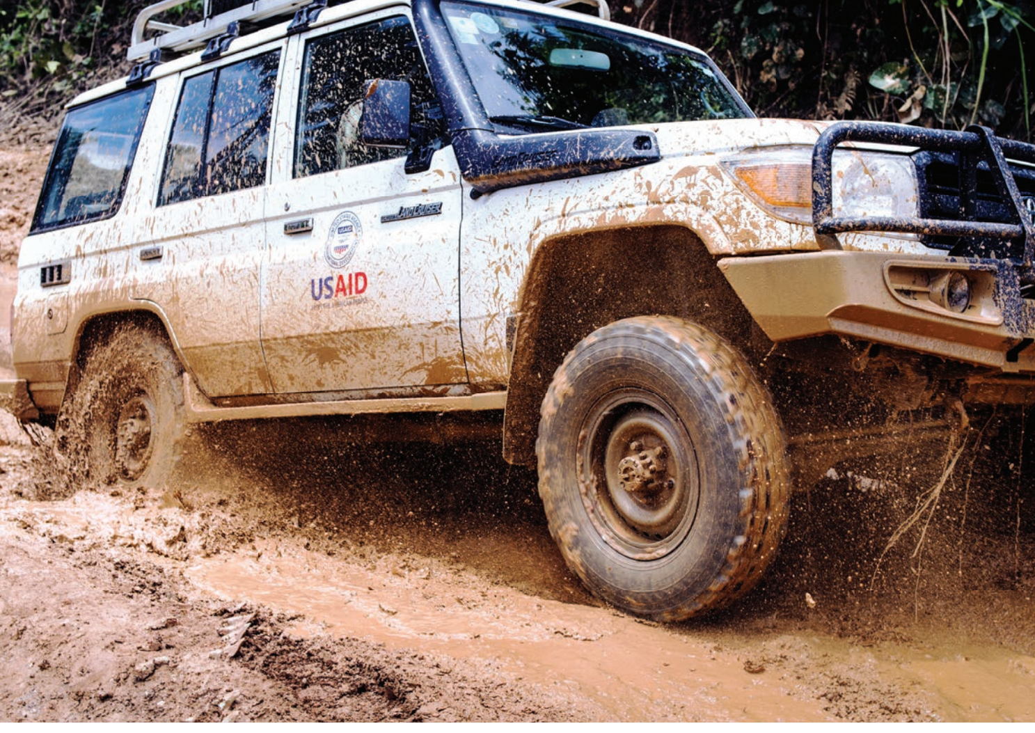
A USAID vehicle navigates a muddy road in rural Liberia.