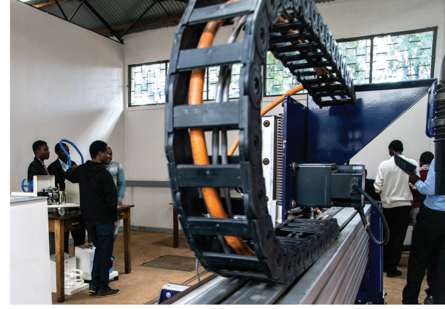
The Innovations's MAKER space in Nairobi, Kenya.

Since 2010, USAID has awarded Concern over $150 million, making it possible to carry out life-saving programs that have transformed millions of lives around the world.