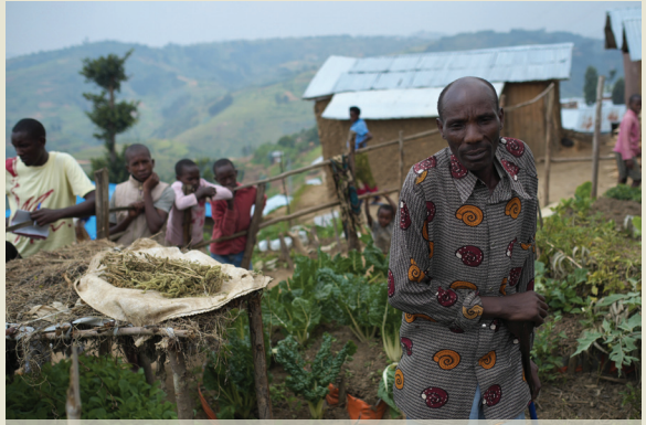
A beneficiary of the emergency nutrition interventions in the Kigeme Congolese refugee camp in Nyamagabe district.