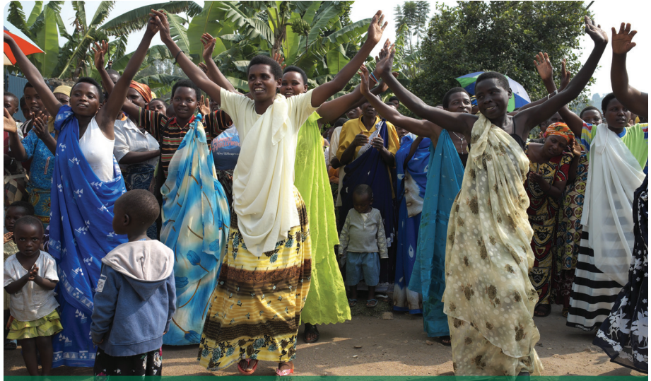
Women dance at a community health centre in the southern Rwandan village of Gisagara. The health centre is part of a community-based nutrition programme that Concern supports by training several hundred health workers. Photo: Cheney Orr. 2014