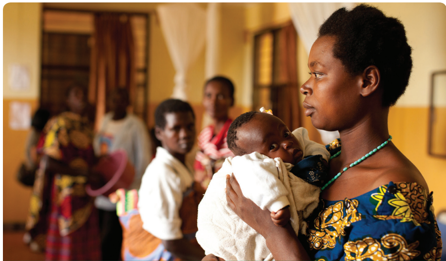
A mother waits for a local doctor to examine her child in Gasambu village, Rwanda. Concern's Kabeho Mwana (Life for a Child) programme worked to reduce child mortality in six underserved districts, reaching more than 318,000 children under five years old.