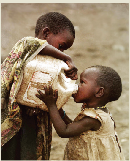
A child gives another child water during the humanitarian crisis sparked by the genocide in Rwanda.

1997 Out of an estimated 218,000 refugees repatriated back to Rwanda in 1997, a total of 11,568 returnees and 10,478 unaccompanied children passed through the Concern managed transit centres.