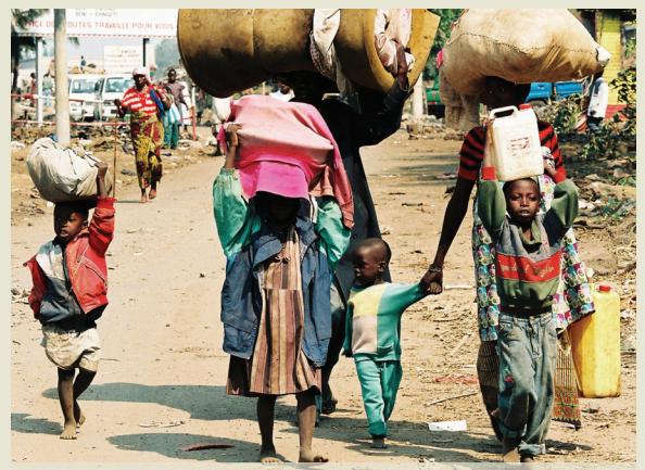
Children fleeing the genocide in June 1994.