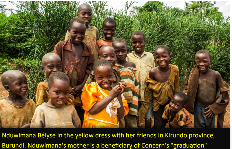
scheme.

Concern Worldwide Burundi currently works in Kirundo and Cibitoke Provinces, the populations of which have been identified as particularly poor and vulnerable compared to other provinces. Concern has two programmes in each province: a social protection programme (also called the Graduation Model Programme) and a health and nutrition programme. Together, these programmes encompass a range of activities, including health, nutrition, social protection, resilience, education, Disaster Risk Reduction (DRR), and gender-based violence (GBV).