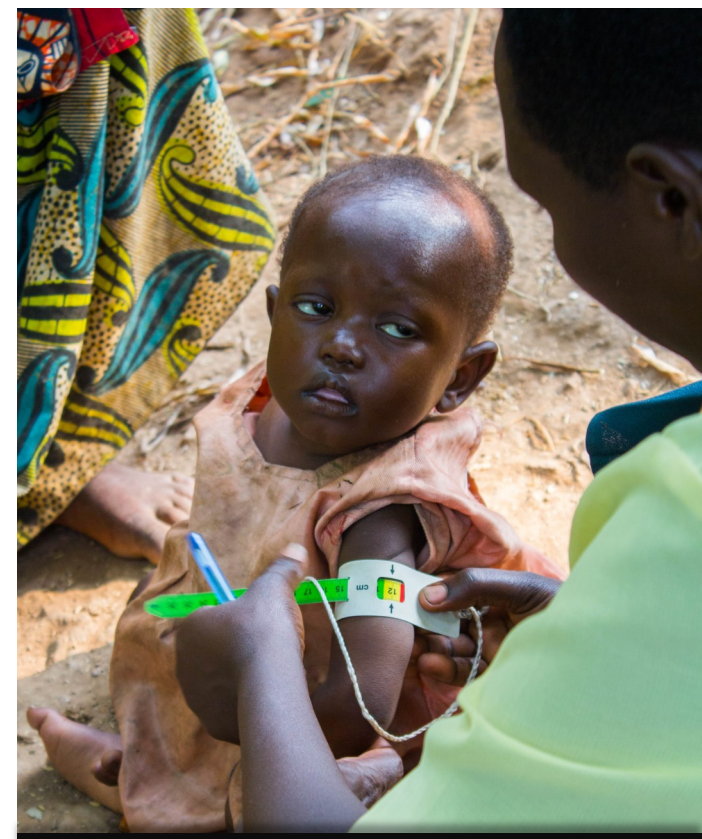
Kirundo Commune